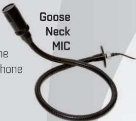
Goose Neck MIC