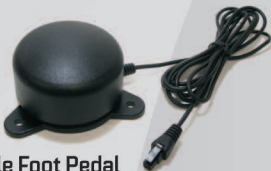
In-Vehicle Foot Pedal